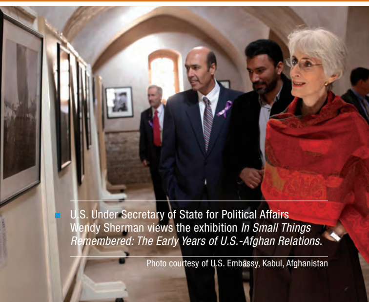
■ U.S. Under Secretary of State for Political Affairs Wendy Sherman views the exhibition In Small Things Remembered: The Early Years of U.S.-Afghan Relations .

Through the Meridian Center for Cultural Diplomacy, we create exhibitions, trainings, and conferences that bridge cultural divides. These programs increase understanding and strengthen relationships between the U.S. and countries around the world.