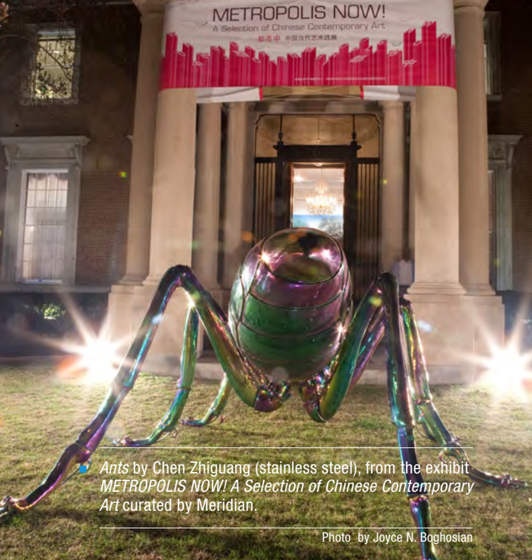
■ Ants by Chen Zhiguang (stainless steel), from the exhibit METROPOLIS NOW! A Selection of Chinese Contemporary Art curated by Meridian.