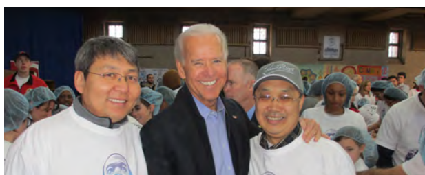
U.S. Vice President Joe Biden meets with international leaders.