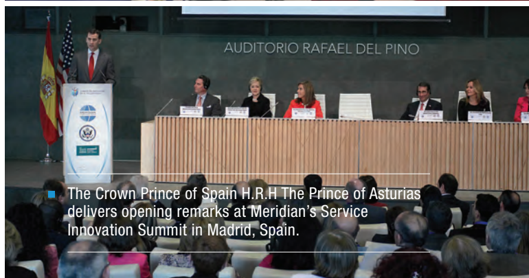
■ The Crown Prince of Spain H.R.H. The Prince of Asturias delivers opening remarks at Meridian's Service Innovation Summit in Madrid, Spain.