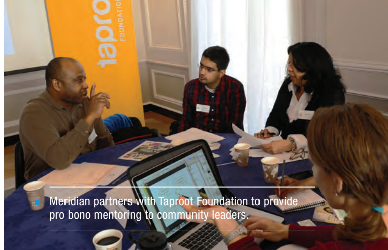
■ Meridian partners with Taproot Foundation to provide pro bono mentoring to community leaders.